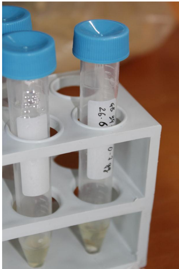
Figure 6. Below